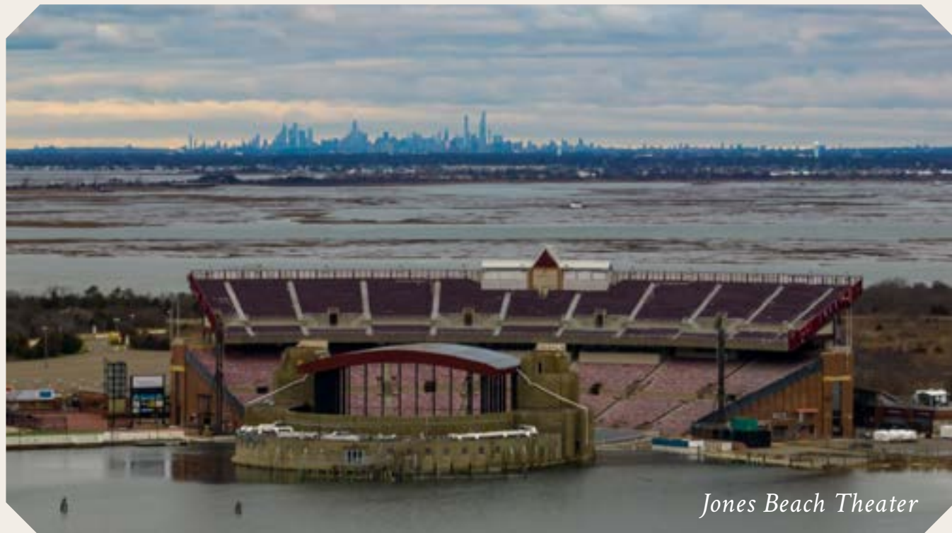
Jones Beach Theater