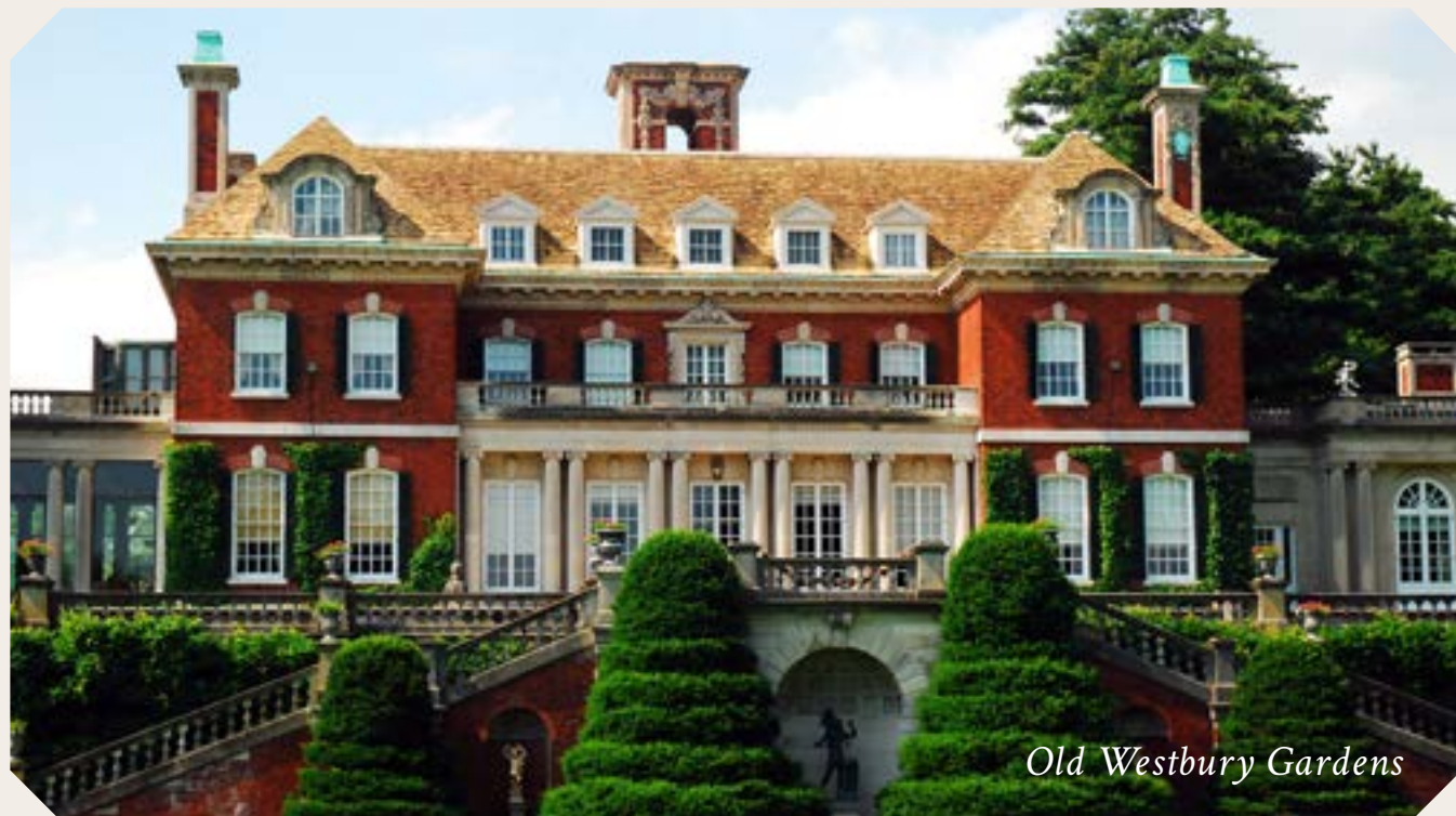
Old Westbury Gardens