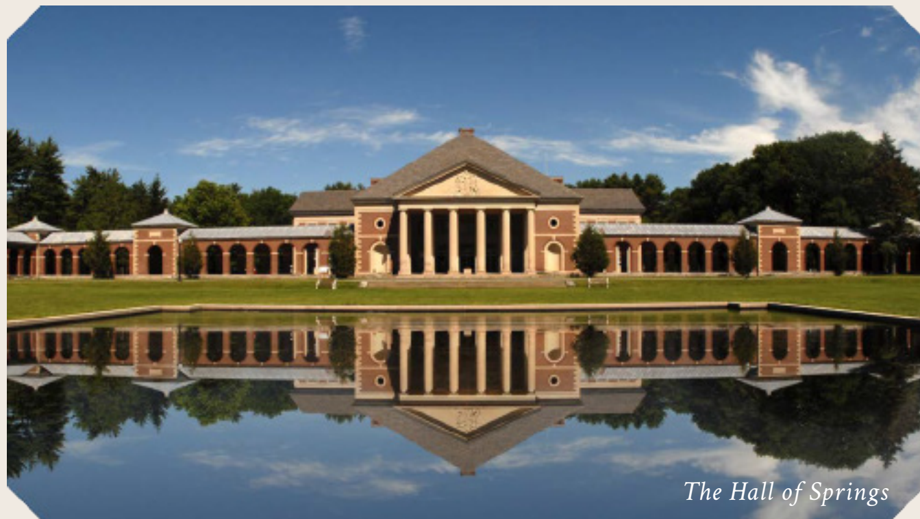
The Hall of Springs