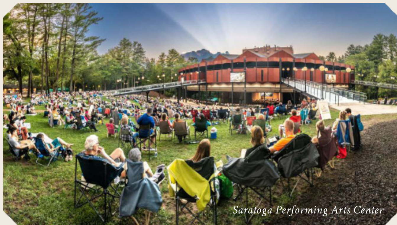
Saratoga Performing Arts Center