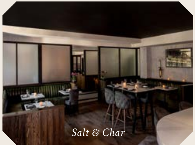
Salt & Char