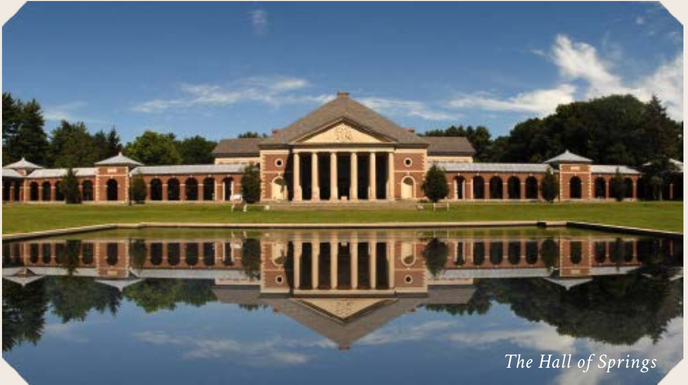
The Hall of Springs