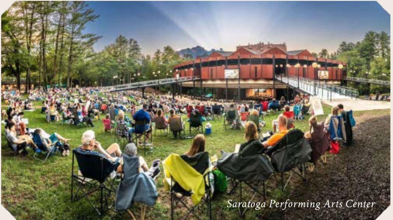
Saratoga Performing Arts Center