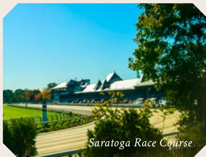
Saratoga Race Course