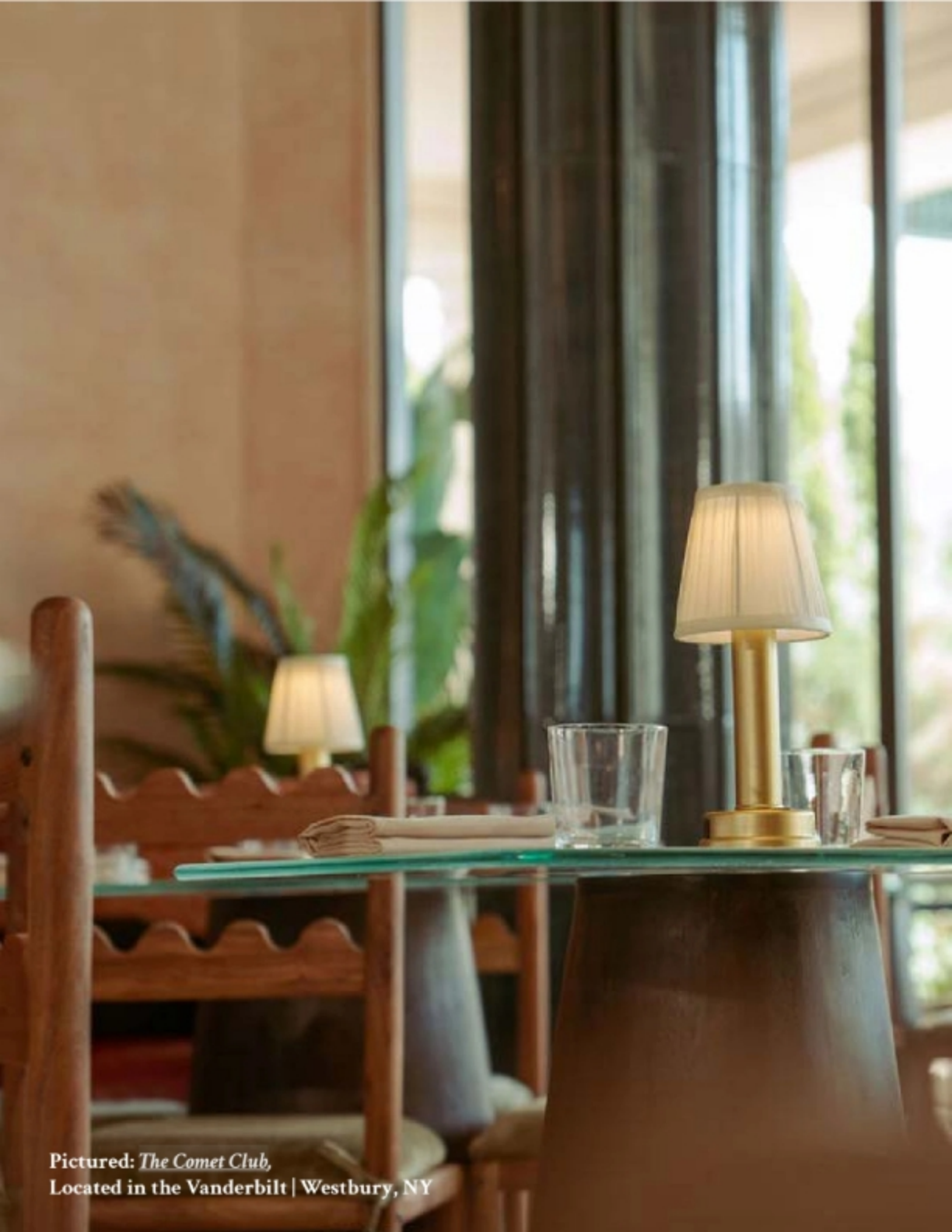
Pictured: The Comet Club , Located in the Vanderbilt | Westbury, NY