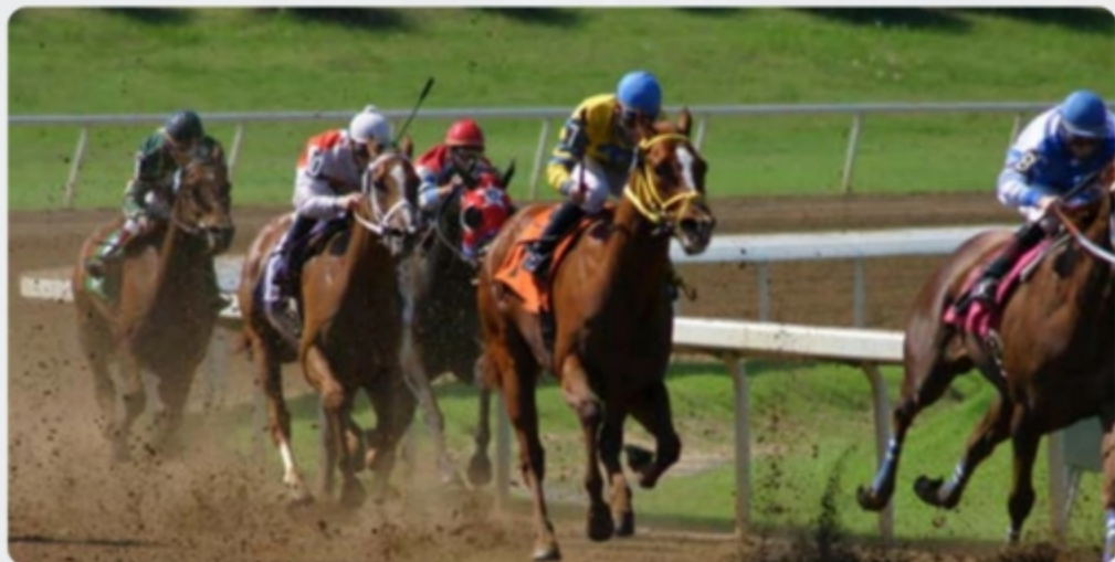
Pictured: Opening Day at Saratoga Race Course