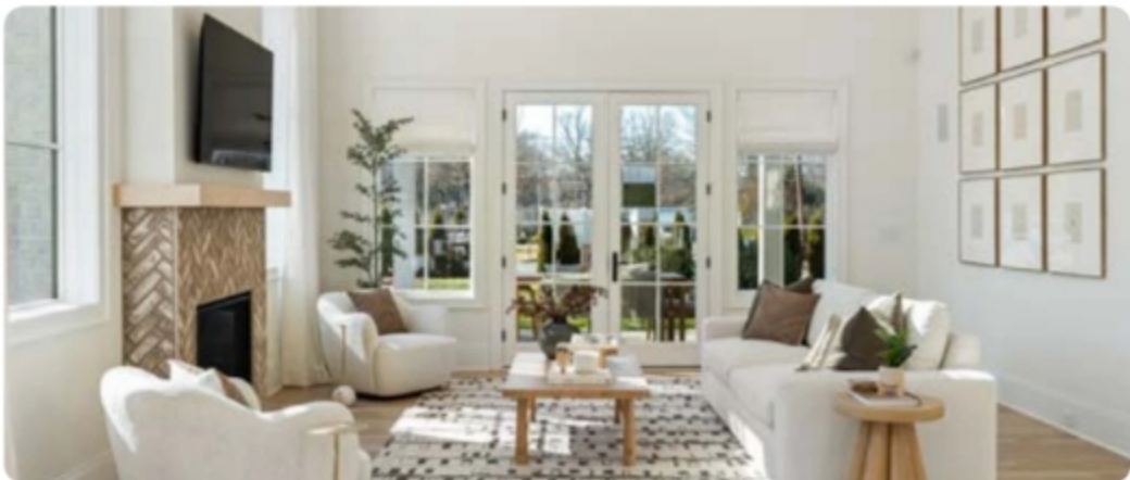
Pictured: Ferncliff furnished model

Move into a designer-furnished model — or custom build