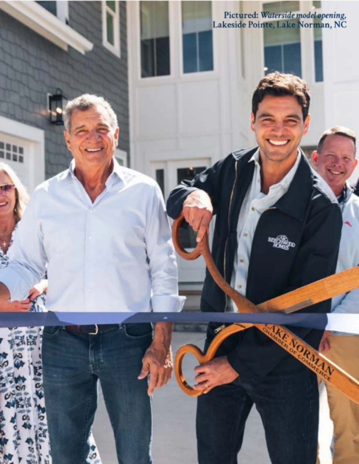
Pictured: Waterside model opening, Lakeside Pointe, Lake Norman, NC