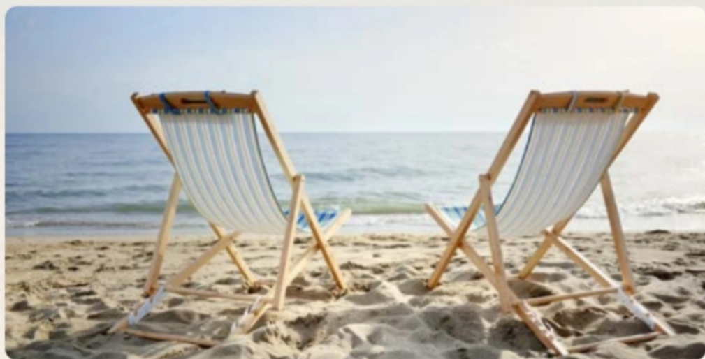
Pictured: Summer on the South Shore

Fire Island, the Hamptons, and beach towns east