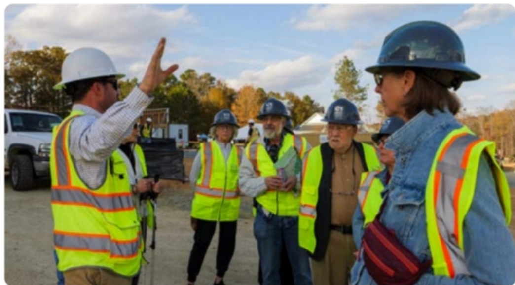
Pictured: Hawthorn Hard Hat event at South Creek

Hawthorn hard hat tours begin. Tour the Hawthorn while it's still in construction and reserve your spot to be in your new home as early as 2027. Limited tour slots available.