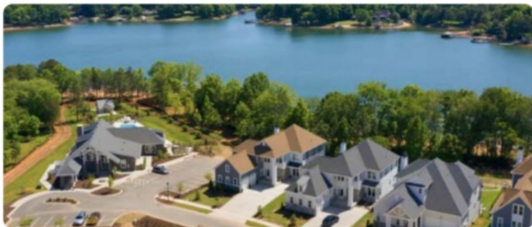
Pictured: Lakeside Pointe waterside homes

New homes available – just steps from the water