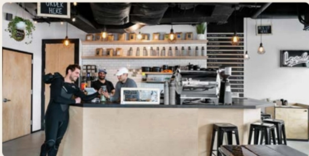
Pictured: A relaxing morning pre-surf at Locals Collective

Boardwalk mornings, beach bar afternoons, ferry home