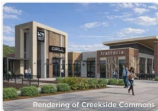
Rendering of Creekside Commons