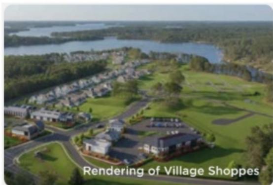
Rendering of Village Shoppes