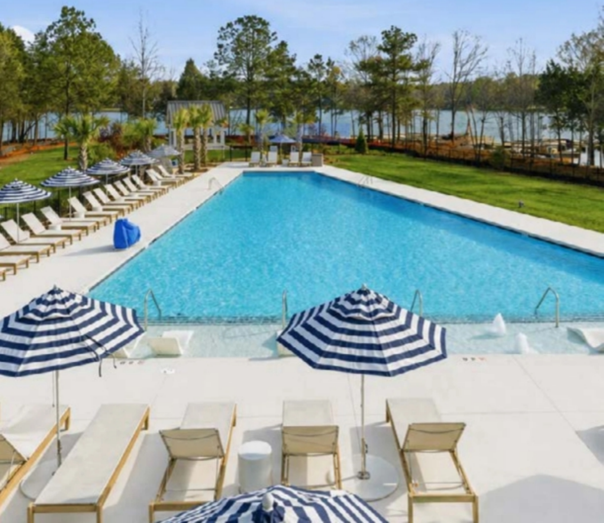
Pictured: Lakeside Pointe Pool Deck Lake Norman, NC