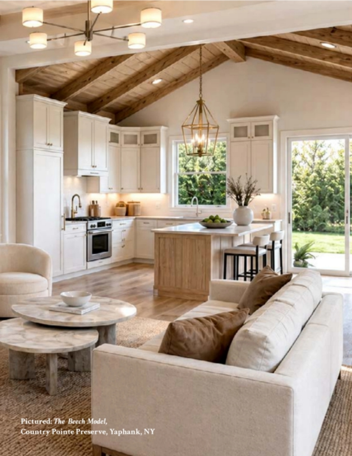
Pictured: The Beech Model , Country Pointe Preserve, Yaphank, NY